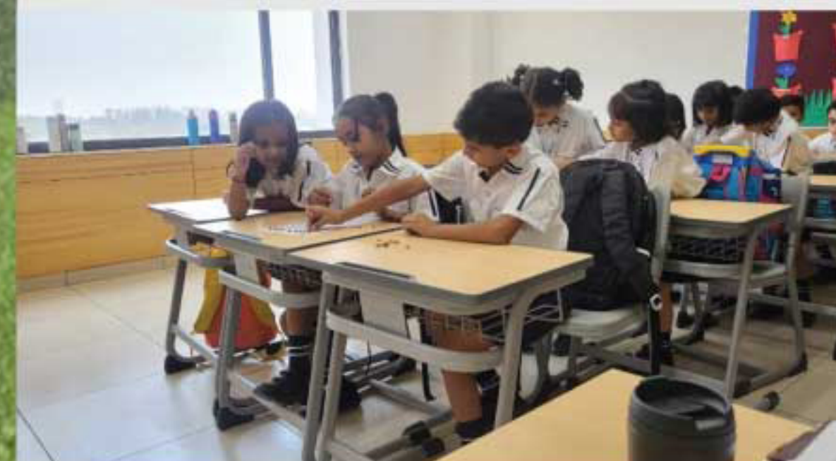
Today the learners of Grade 2 did the experiential activity of counting the gram seeds using a number grid. This group activity strengthened their team spirit and helped them learn to measure using a "number grid".