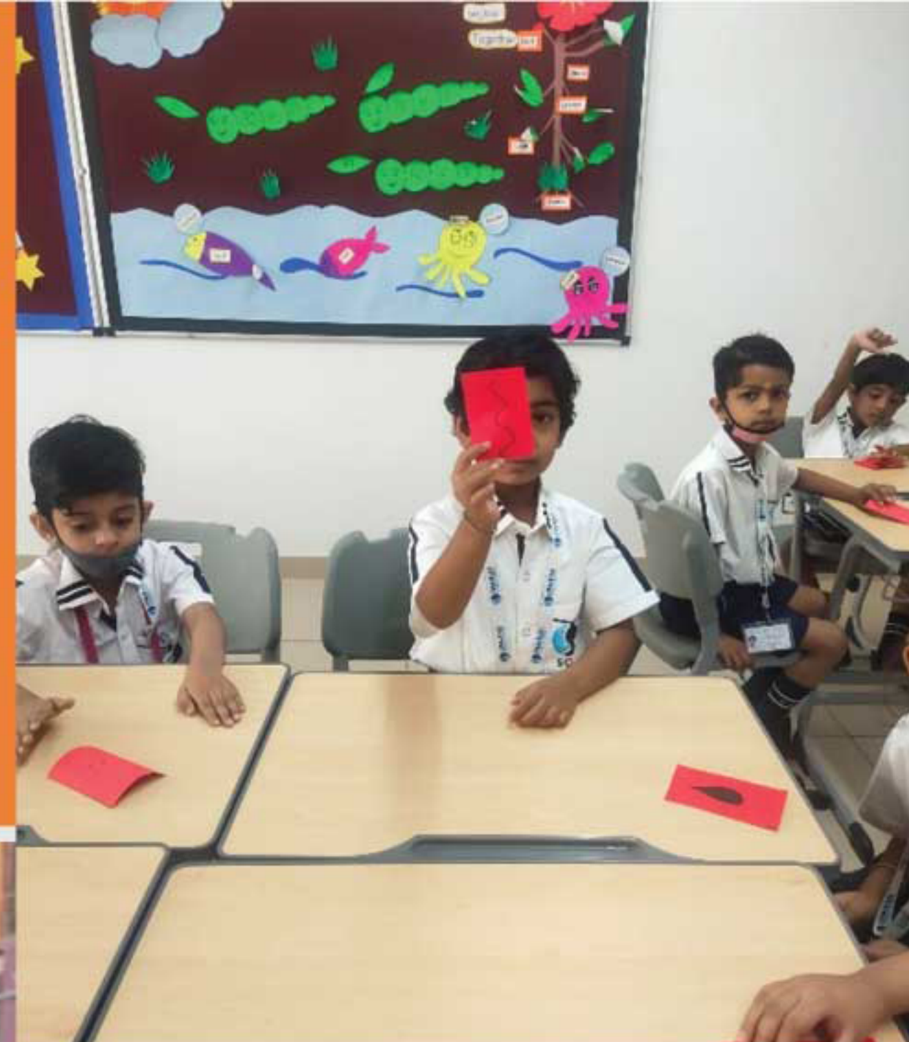
To boost our children's memory and critical thinking skills PICTURE BINGO activity was organised for little Sparshians of grade 1. This activity helped our kids to form mental images of different patterns and match them quickly to find their partner.