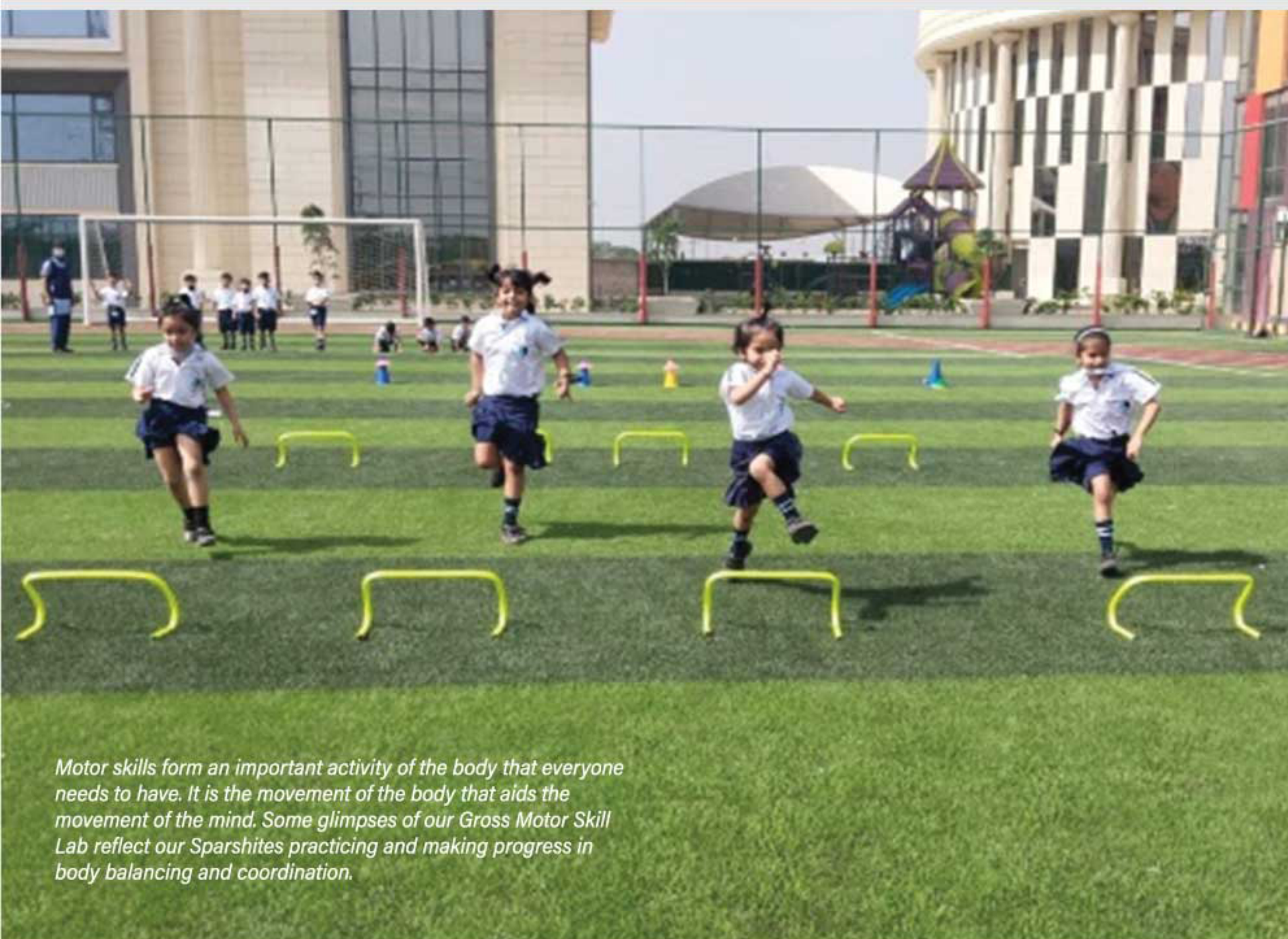
Motor skills form an important activity of the body that everyone needs to have. It is the movement of the body that aids the movement of the mind. Some glimpses of our Gross Motor Skill Lab reflect our Sparshites practicing and making progress in body balancing and coordination.